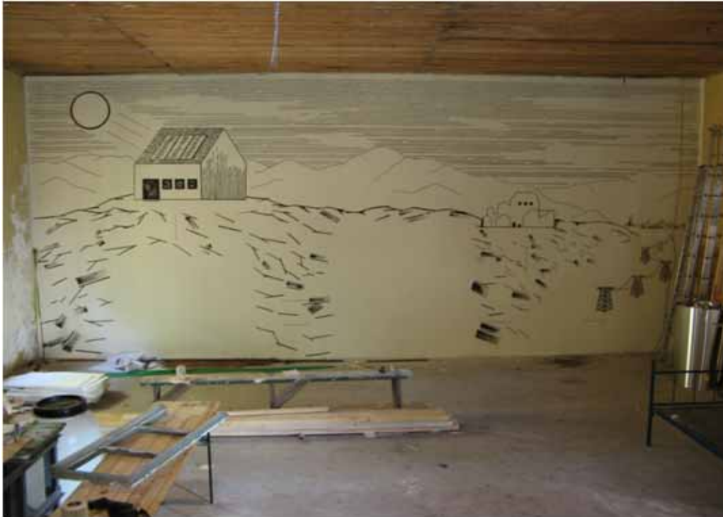
Photo nr.5. Interior view on the west wall of the building. Instalation of the indoor elements of the system should be placed against the wall in logical and „easy to understand“ manner.