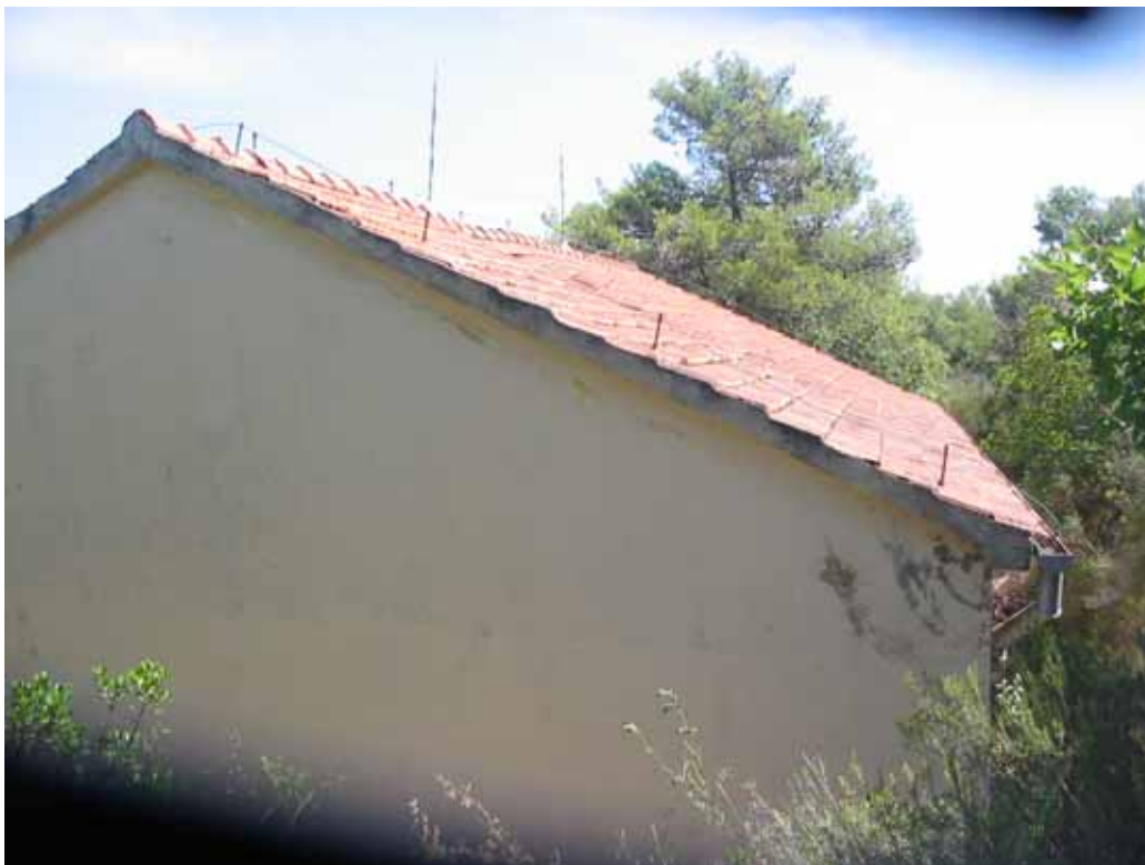
Photo nr.4. View on the south side of the roof and the west wall